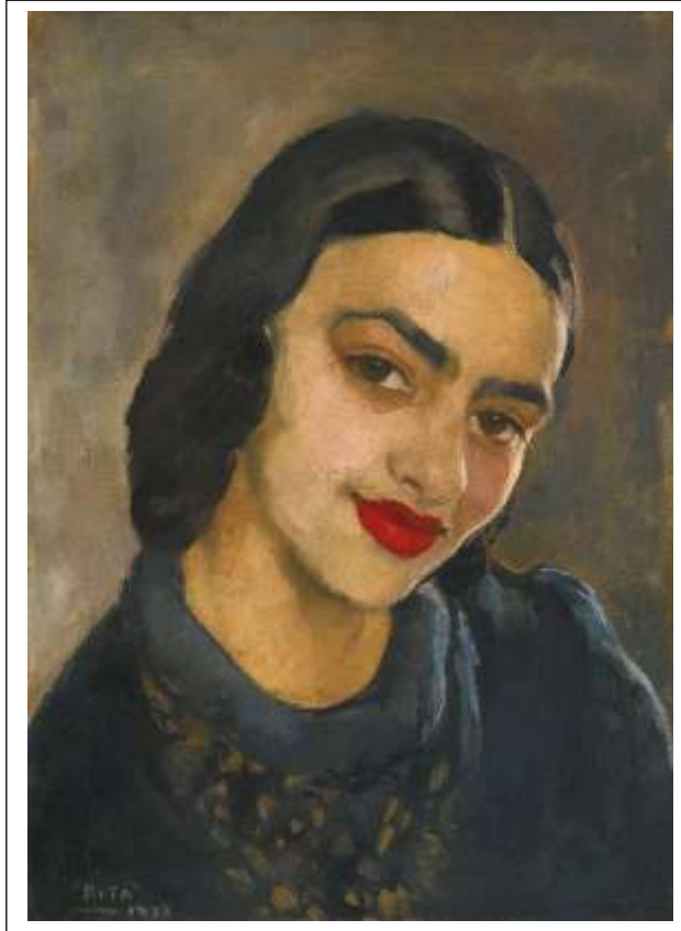
Self Portrait – Amrita Sher-Gil

This is a 1931 self-portrait by Amrita Sher-Gil, depicting one of India's most important modern artists at the age of 18. This is the also first painting by the artist ever to be offered in Christie's London, and one of only eight canvases by Sher-Gil to be offered at auction globally. Sher-Gil's self-portraits are painted with an intensity that is almost hypnotic, drawing the viewer into the innermost psyche of the artist, where one discovers a sea of melancholy.